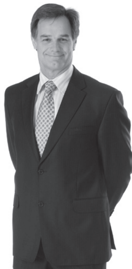
Community services division